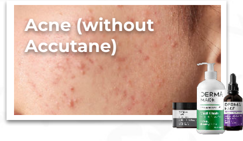
Acne (without Accutane)