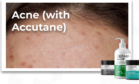
Acne (with Accutane)